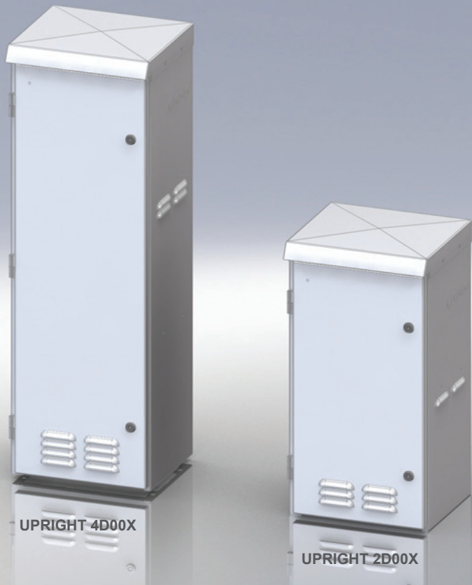
UPRIGHT 4D00X & UPRIGHT 2D00X