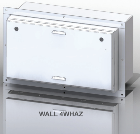
WALL 8WHAZ & WALL 4WHAZ