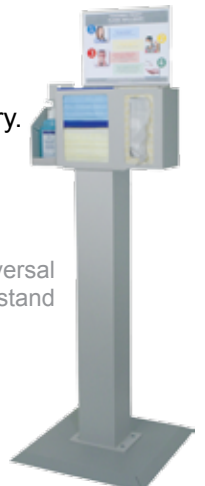
Universal kiosk stand