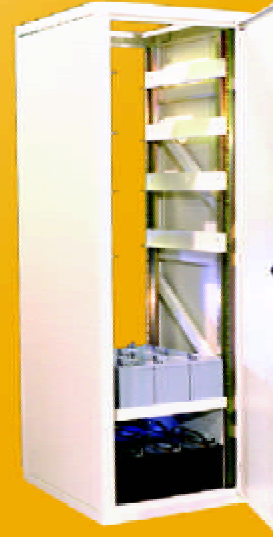
Zone 4 Cabinet with Doors, Side Panels, and Battery Trays