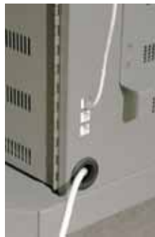
Connecting Cart to Network