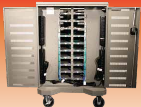
IT Compartment Network Wiring - Power Bricks - Power Management

*Network Wiring is available as an Option