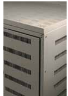
Vents keep Laptops within Operating Temp