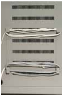
Two Cord Wraps