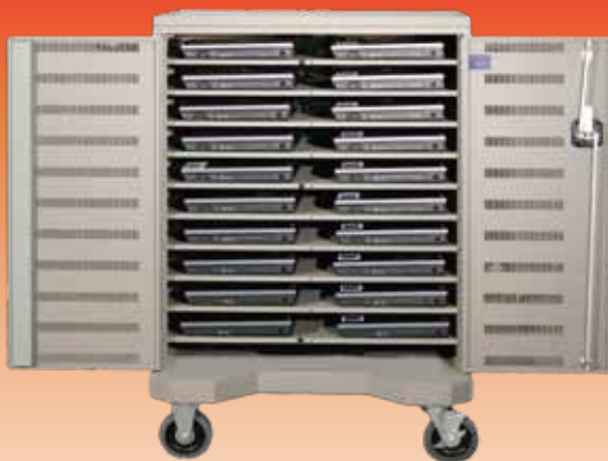
Laptop Storage Compartment Bottom Router Shelf