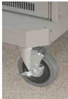
Industrial 5" Casters