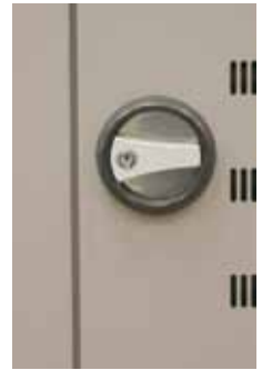
Locking Reinforced Steel Doors