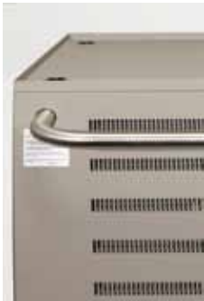
1 1/4" Stainless Steel Handle